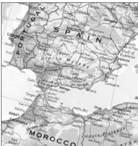
Gibraltar - The location of this true story

Note: The words that the soldier was thinking about are found in the Bible as part of 1 John chapter 1 verses 5 - 9: "The blood of Jesus Christ God's Son cleanses us from all sin... If we confess our sins, He is faithful and just to forgive our sins and to cleanse us from all unrighteousness" .