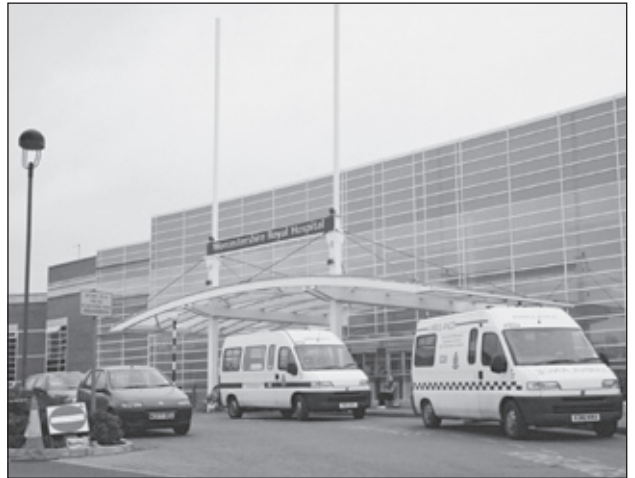
Worcestershire Royal Hospital

Every experience of life is a "learning experience" and particularly when things happen which are out of our control. In my own experience, I was reminded that my life belongs to God and that I cannot take one breath without His help, I cannot live another day without His grace and I have no hope for the future without God. Perhaps you have learned that too.