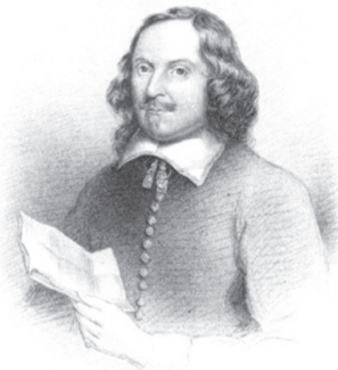
Edward Winslow One of the most famous of The Puritan 'Pilgrim Fathers' - born in Droitwich in 1595

The portrayal of the Puritan era of the 16th and 17th century in this country is often of people who were over religious, rigid, sour and kill joys. Nothing could be further from the truth! Puritan Christians were men and women of great spiritual insight and maturity and they had their priorities right! They were people who lived by the truths of the Bible while on earth but looked forward to heaven as their true home. In this issue of the Herald we include some quotations from that era which direct our thoughts to the subject of heaven.